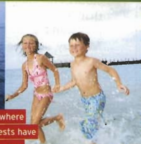
Scenes from the Tryall Club, where villa owners and their guests have been gathering for more than 50 years