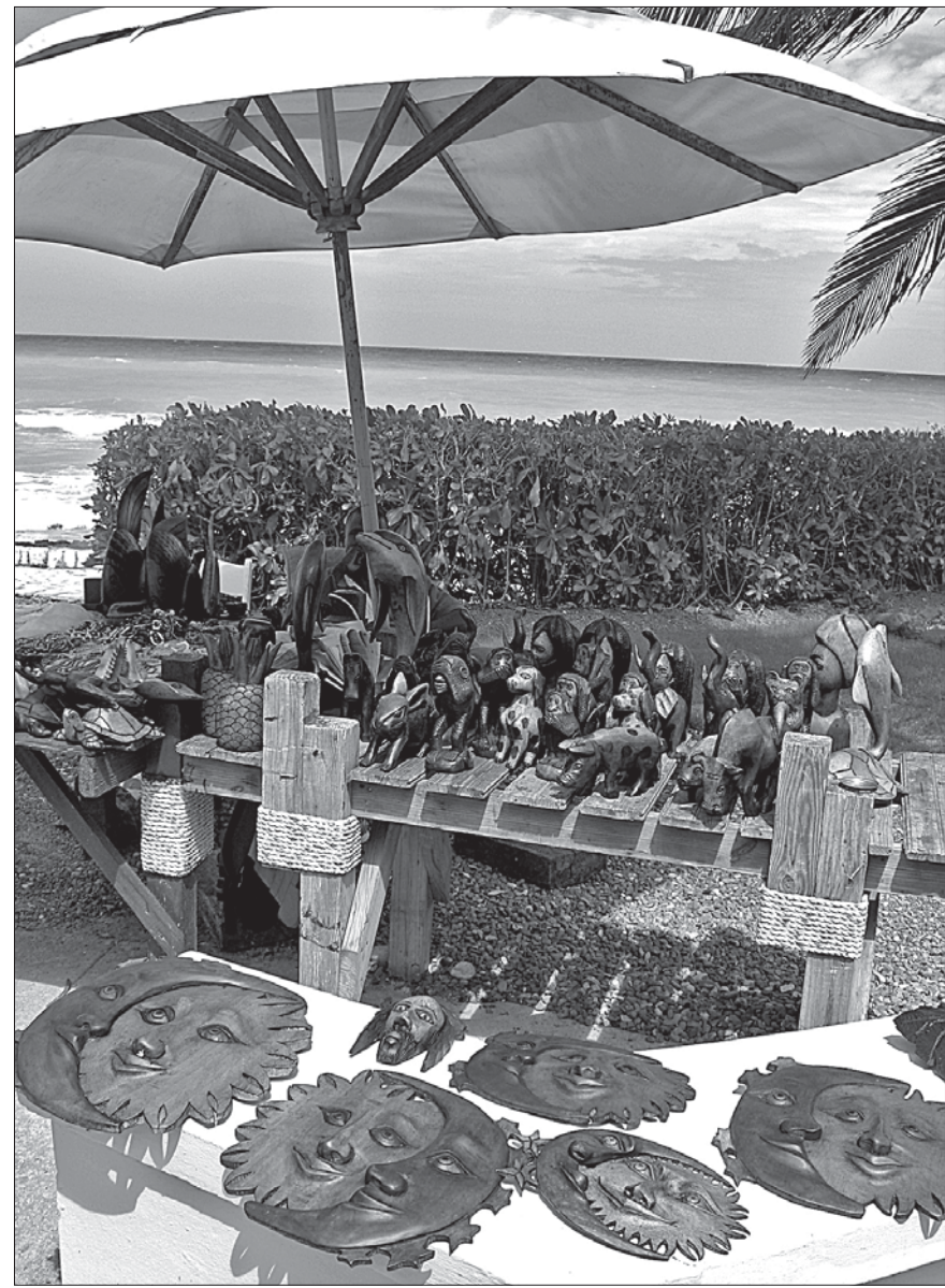
TAKE HOME CULTURE: Jamaican handicrafts for sale.

contraption the local Taino Indians discovered and one which Columbus took back with him after he "discovered" Jamaica on his second voyage to the New World in 1494. Although Columbus was actually stranded on the island for a year when his boat was blown off course and eventually sunk, the rest he and his crew received in para-