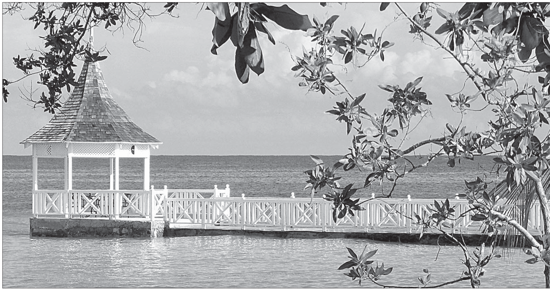
HALF MOON: A romantic gazebo at Half Moon, a resort that has played host to international celebrities.

Buses are the norm now, but long ago (well, the beginning of the 1900s anyway), visitors came to Jamaica from Boston and Baltimore onboard banana boats and spent time enjoying the slow life offered at Jamaican hotels. Cruise ships have taken over for the banana boats and the sleepy hotels have changed into vibrant resorts. However, one thing modern day visitors can still find is the quiet life of the spa—aaah! All the spa amenities you'd want, not to mention expert masseuses, can be found at the Half Moon resort.