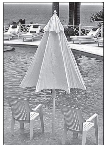
POOLSIDE: Deckchairs surrounding one of the pools at Tryall.

everything you need to do nothing but relax or, if you prefer, to take up water sports. It's everything you'd expect from a top class resort. So laid back is the island that, in the 1950s and 1960s, Errol Flynn used it as an exquisite escape from all his filming. Today his secret getaway has been found out. The establishment has also won a host of awards including the 2006 Travel & Leisure's 500 Best Hotels in the world and it boasts 398 beautifully appointed rooms and cottages.